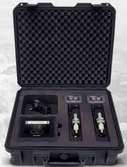
SafeTest TM2 Channel Kit