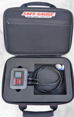
SafeSwitch Individual Kit