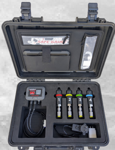
SafeSwitch 4 Channel Kit