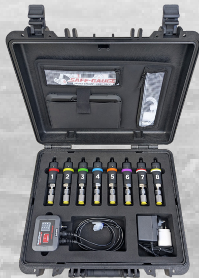
SafeSwitch 8 Channel Kit